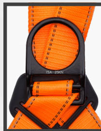
Dorsal D Ring